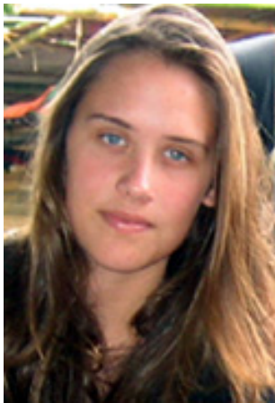
Management Major, Global & Strategic Management Concentration International Business Minor East Asian Studies Minor