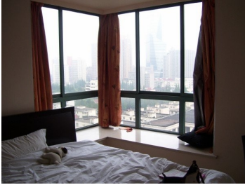
Rebecca's fabulous window view of Shanghai.

"We share memories that will bond us for a lifetime....struggling to use our limited vocabularies after a friend broke her nose competing in a break dance off, to tasting Sichuan Tai (extremely spicy food) and losing all taste sensation.