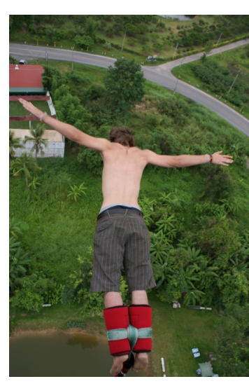
A bungee jump free fall in the backpacker's paradise of Chiang Mai