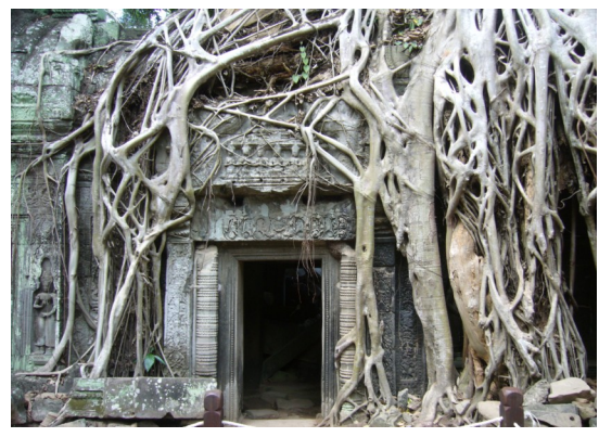
Ancient ruins of Angkor Wat found in the city of Siem Reap, Cambodia

Anyone who's reading this, I hope you travel. I hope you make connections and build relationships. Go somewhere you've never been, live in a manner that you've never lived; eat foods you've never dreamed of eating! Taking that first step onto Thai soil was like taking a running leap off into the clouds. Every second was a surprise, is a surprise. Thailand is so vibrant, colorful, and full of amazing sights, sounds, and people. Every second I was trying to take it all in. Coming back to the U.S. hasn't stopped my free fall of experience, and it won't stop until the day I die. My mind has been opened, I now see the world in a different light, with a more vibrant, exotic, and monumental shade. With everyday, every second, a chance to grow. Everyday, every second