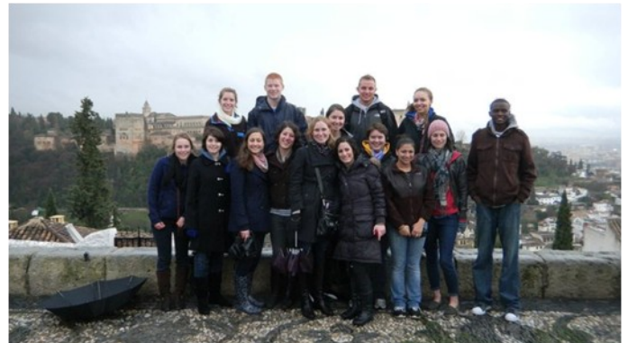
My IES welcome week group

am proud to say that I recently accepted a position with Kimberly Clark where I will be supporting their Latin American operations and using my Spanish every day. Later in my career (but not too far down the road) I will have ample opportunities to travel the world with this company. Without my study abroad not only would I have never had this opportunity, I wouldn't have even known it was something I had a passion for! So when I tell you study abroad changes you in ways you wouldn't even imagine, believe me that it is true. The only way to really understand what I am saying is to do it yourself!