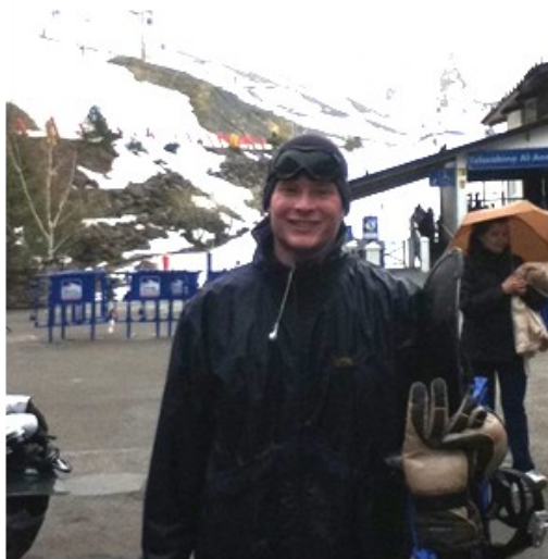
Snowboarding in the Sierra Nevadas