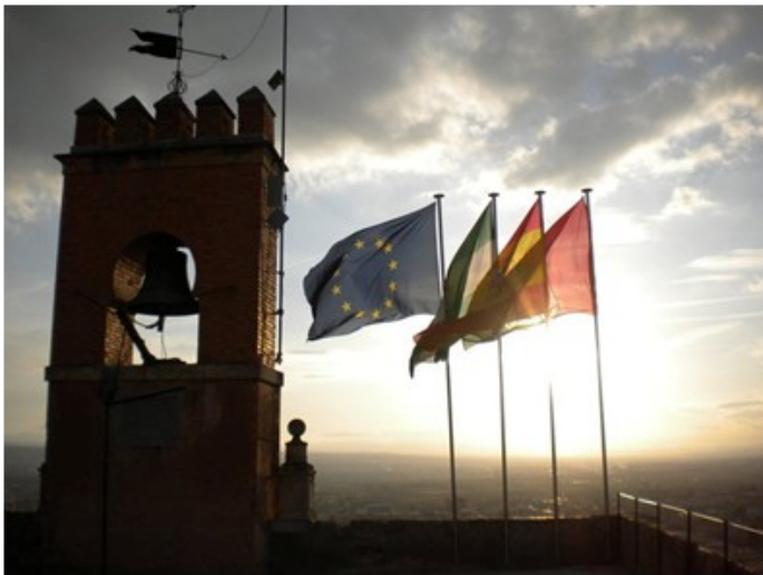
The view from the Torre de la Vela of the Alhambra

Originally I had thought that Sevilla would be the best fit possible for me. I couldn't have been more wrong. Granada turned out to be the best fit possible. It is an eclectic city composed of roughly 300,000 residents and a very large student population. The University of Granada is home to roughly 60,000 students and, like many college towns, everything in the city is geared towards students. Prices on virtually everything are lower than other major cities in Spain and Europe. There are thousands of students from all over the world to get to know! It was not unusual for me to meet people from five or six different countries in one night when going out in Granada. It is the perfect place for a study abroad student to improve their Spanish language skills dramatically, while having the time of his/her life.