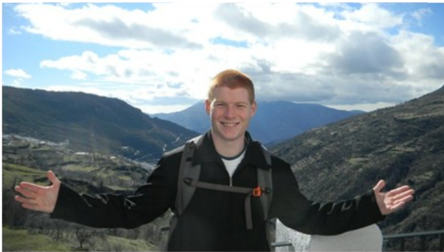
IES sponsored trip to Las Alpujarras

How do you describe something that is truly indescribable? How do you describe an experience that changed you in ways you never imagined, that exposed you to countless things you didn't even know existed in the world, and ultimately made you a better person? To summarize an experience like the one I had in the spring semester of 2011 in Granada, Spain is nearly impossible, but I'll do my best.